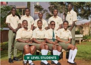
'A' LEVEL STUDENTS

EXCELLENCE | HARD WORK INTERGRITY | LOVE | MORALS