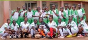
Girls' football Team