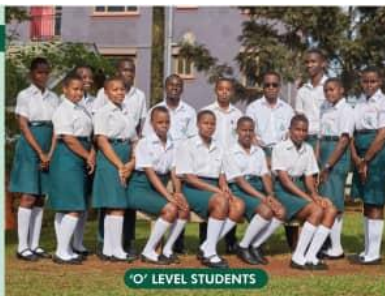
'O' LEVEL STUDENTS