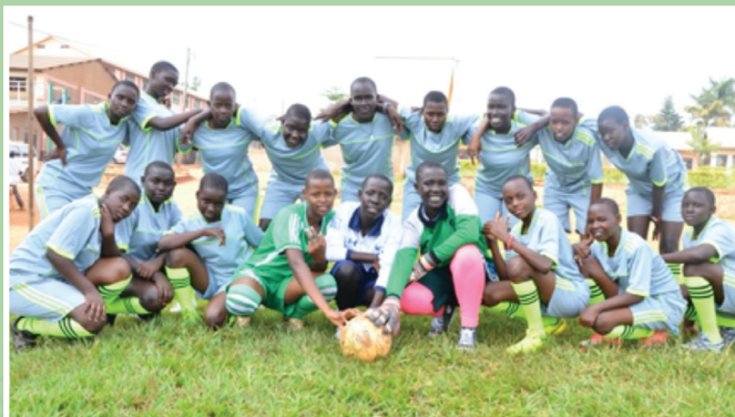
Girls' Football Team