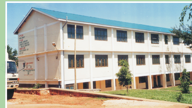
Main Library and Science Labs