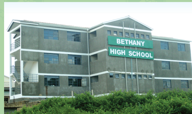
The girls' dormitory