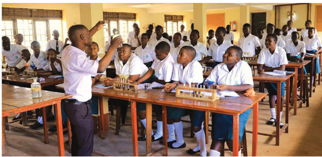
Students conducting practicals in a science laboratory.