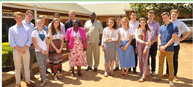
Truro - a partner school from England visits Bethany H.S

Bethany is in partnership with a number of schools both nationally and internationally. This has helped to modify the school curriculum.